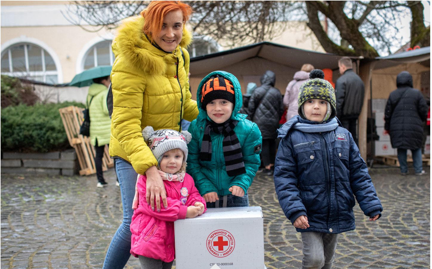
At the Red Cross city branch in Uzhhorod, Ukraine, Red Cross volunteers distributed hygiene kits to displaced families following the escalation of armed conflict in February 2022.