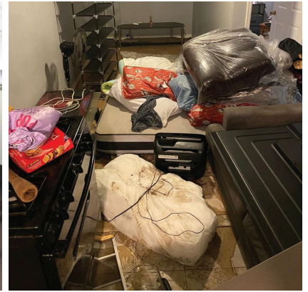
Sidikat Tiamiyu's apartment was rendered unlivable by flooding from Hurricane Ida's remnants.

"I lost everything. I had to start over."