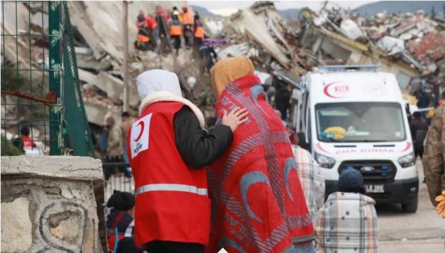
Following a devastating earthquake that struck Türkiye and Syria in February 2023, the Turkish Red Crescent—with support from the global Red Cross and Red Crescent network — deployed thousands of employees and volunteers to respond to the urgent needs of millions affected by the quakes.