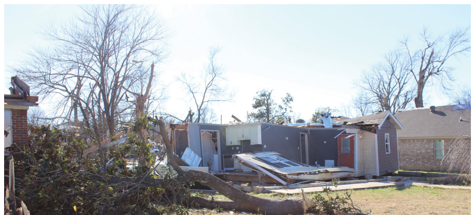
Tornadoes tore apart this Arkansas home. Housing remains one of the most common barriers to recovery. The Red Cross is working with local nonprofits to help residents overcome these barriers and find permanent housing solutions.

Contractors working with the All Hands and Hearts program will build at least 20 tornado shelters, some of which will be shared by households near one another. In addition to construction, All Hands and Hearts will help