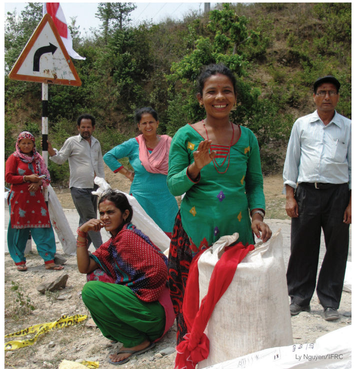
Families from Sindhuli with shelter toolkits provided by the American Red Cross. These toolkits will help residents construct temporary shelter until their homes can be rebuilt or repaired.

The American Red Cross responds to disasters around the world by mobilizing cash support, pre-positioning relief supplies, deploying disaster response experts and, in some cases, implementing recovery and preparedness programs. The remarkable generosity of our supporters—individuals, corporations and foundations—drives our ability to provide relief and assist our partners in the global Red Cross network. We are grateful for your trust.