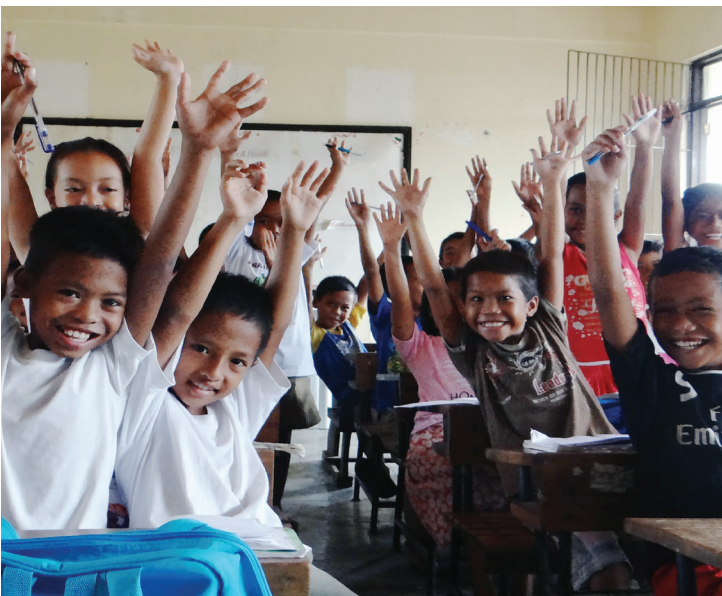
Children at Tanghas Elementary School, where the Red Cross is repairing classrooms, installing hand water pumps and constructing new latrines.