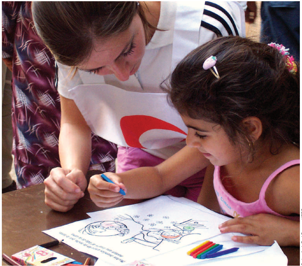
The Syrian Arab Red Crescent Society set up a special reception operation to accommodate displaced families in Damascus.

Starting on July 16, 2006, lives in Lebanon and Israel were thrown into turmoil by a 34-day conflict that killed hundreds, wounded thousands and displaced nearly a million people. The American Red Cross contributed nearly $1.9 million to Movement partners' efforts to provide medical care, shelter, emergency relief supplies and other essentials for 65,000 displaced people. Funds were also allocated to strengthen the preparedness and response capacity of national societies affected by the humanitarian crisis—primarily in Lebanon, Israel, Syria, Cyprus, Jordan and Egypt.