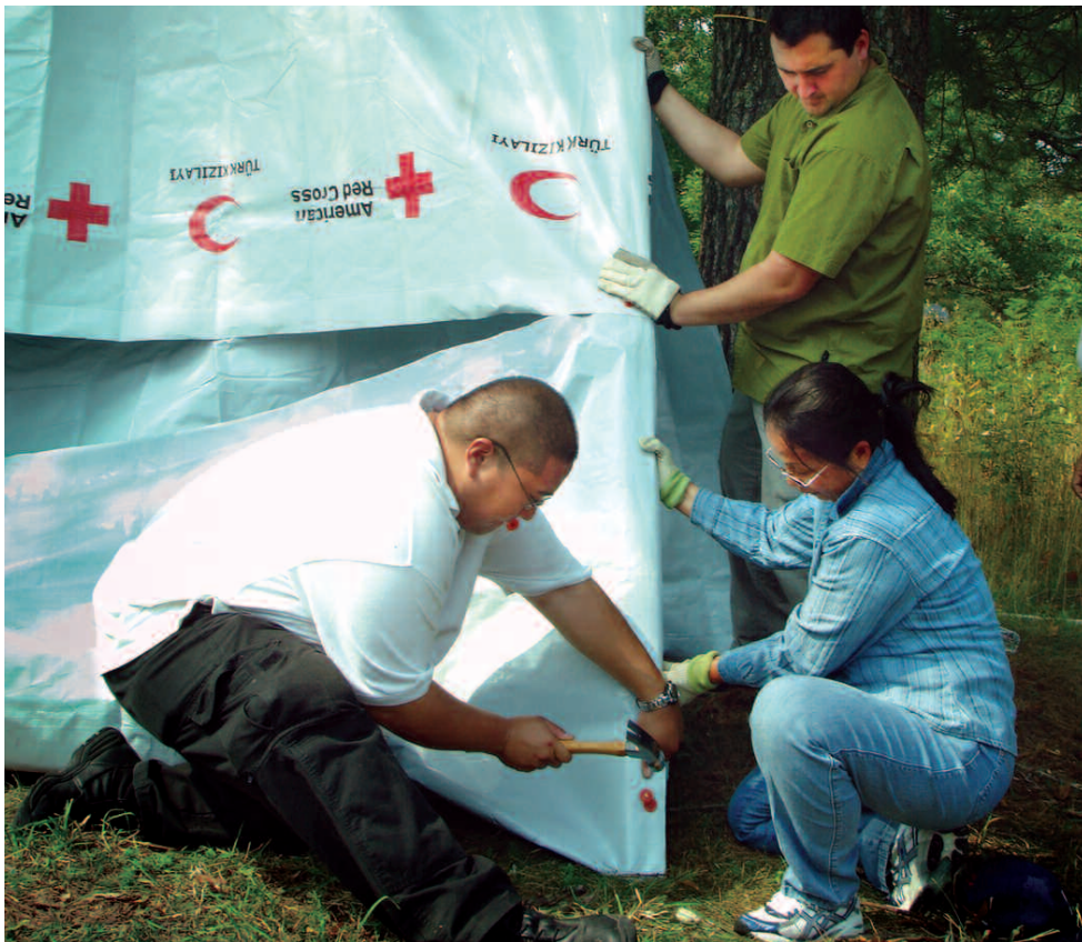
American Red Cross volunteers construct a temporary shelter during a training activity near Washington, D.C.

W hen international assistance is requested after a disaster strikes, the American Red Cross can respond by deploying disaster relief workers, mobilizing relief supplies and contributing funds received from our donors. Since disaster worker deployments is one of the three response options, the American Red Cross puts great emphasis on recruitment, training and building the expertise of our disaster responders. Sending skilled and trained workers to a disaster is fundamental to ensuring effective and appropriate humanitarian assistance. The American Red Cross also plays a key role in developing global training curriculums and improving disaster response tools to better support Movement partners.