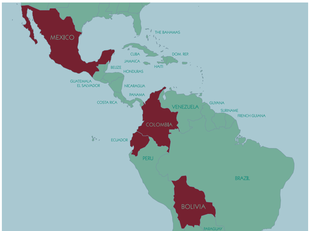
A man returns home carrying Red Cross relief supplies after massive flooding in Bolivia. Below: Map of Latin America with countries shaded displaying American Red Cross disaster responses.