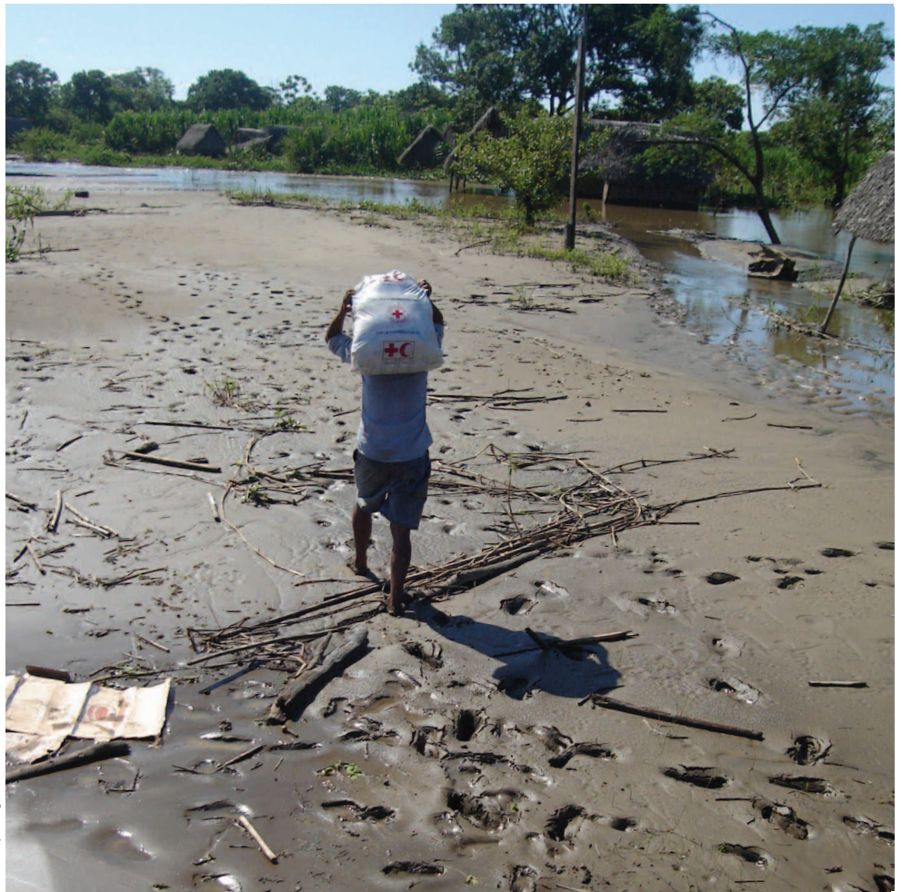
Carlos Seijas/Argentine Red Cross

On April 24, 2007, an intense tornado swept across the northern state of Coahuila in Mexico. It affected 7,000 people and damaged hundreds of homes, buildings and infrastructure. The American Red Cross provided $20,000 to the Mexican Red Cross for the distribution of personal hygiene kits, lanterns with AM/FM radio, kits for young children—diapers, bibs, talcum powder, soap and shampoo—and kitchen kits to 3,000 people affected by the tornado.