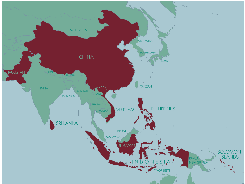
Map of Asia with countries shaded displaying American Red Cross disaster responses.

Between September and December 2006, five typhoons slammed into the Philippines resulting in 650 deaths, 700,000 people displaced and 2.5 million people affected. Two of these typhoons also hit Vietnam and affected an additional 1.3 million people. The American Red Cross deployed two disaster responders to the Philippines and contributed $850,000 to support relief efforts in both countries, collaborating with Movement partners to assist nearly 1.1 million people.