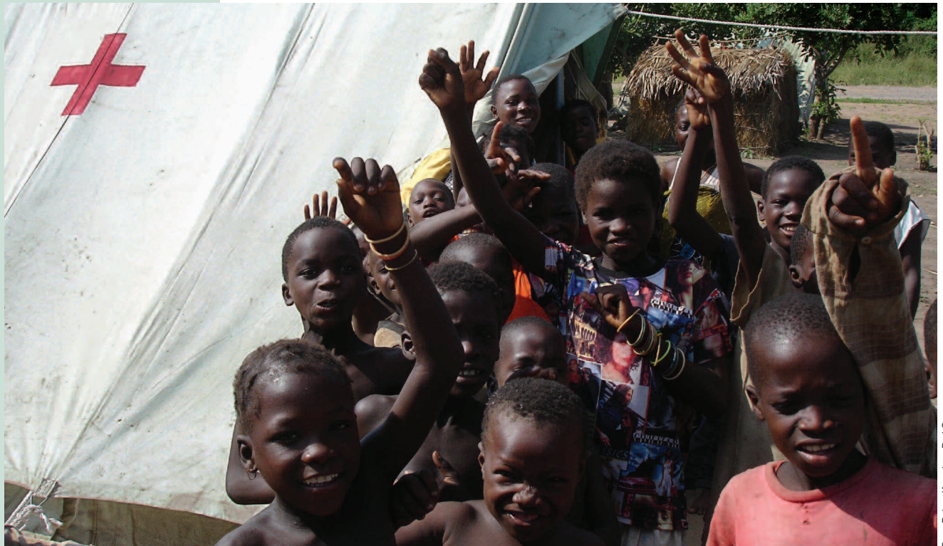
Children in Mozambique temporarily reside in accommodation centers supported by the Red Cross.

Your generosity enables the American Red Cross to respond to numerous crises and disasters around the world each year. On behalf of the American Red Cross and those we serve, thank you for your continued support of this important humanitarian work.