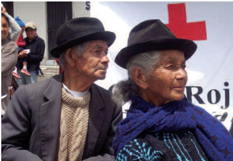
An Ecuadorian couple receives Red Cross assistance following a volcanic eruption in August 2006.