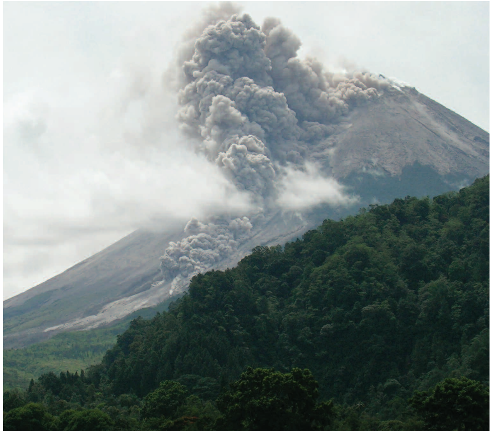
Indonesian Red Cross

The American Red Cross – with its Movement partners – helped an estimated five million people on six continents.