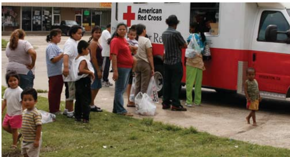
Individuals and families line up before a Red Cross emergency response vehicle for meals and bottled water in Wallisville, Texas, after Hurricane Ike knocked out power to their neighborhood.

On June 1, the Red Cross marked the beginning of hurricane season 2008. It proved to be one of the most destructive and costliest hurricane seasons in U.S. history.