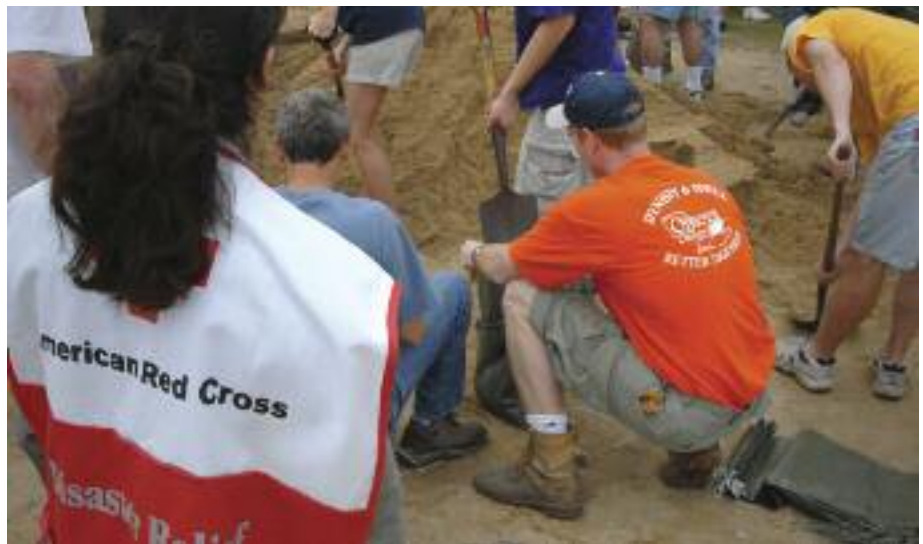
The Red Cross distributed meals and snacks at sand-bagging sites—like this one in Cedar Rapids, Iowa—throughout states affected by flooding.