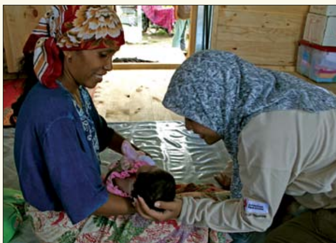
A Red Cross worker in Indonesia visits a mother and her baby for a health checkup.

As part of the “Malaria Free Aceh” campaign in Aceh, Indonesia, the American Red Cross is working to help avert an outbreak of malaria. Insecticide-treated bed nets have proven to be one of the most effective methods of malaria prevention. In addition, the initiative is supporting school-based malaria awareness activities that teach students about the importance of using bed nets. Initial results indicate a 73 percent decline in infection rates in areas where bed net distributions and education activities have taken place.