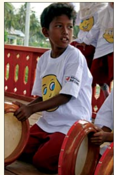
Making music is one way psychosocial programs help children heal.