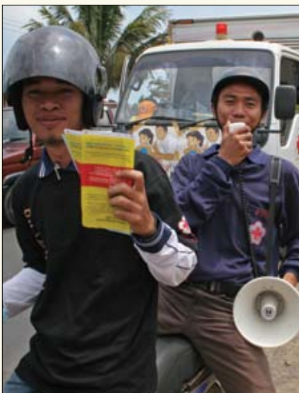
Indonesian Red Cross workers spread the word about an upcoming measles campaign.