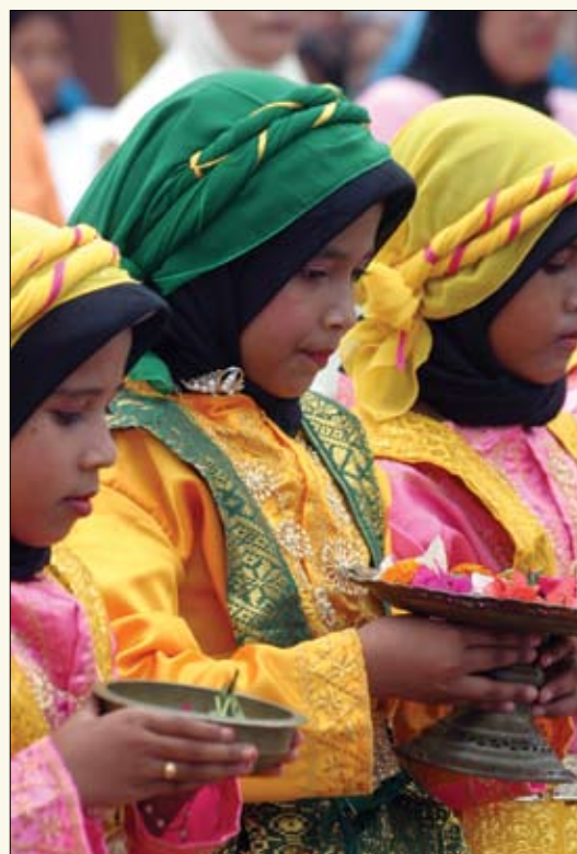
Girls participate in a traditional ceremony in Aceh, Indonesia.