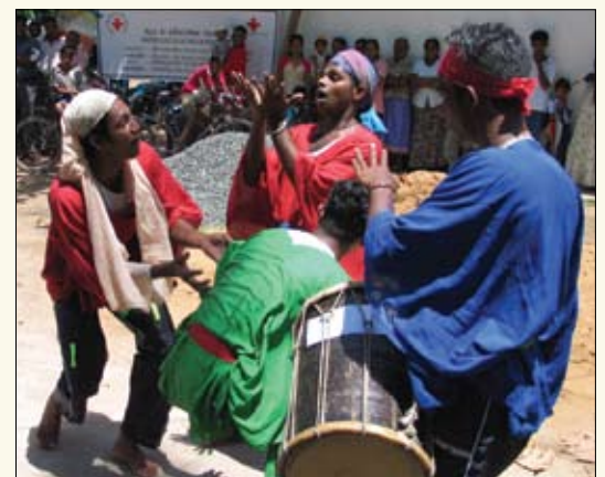
Sri Lankan students perform a hygiene promotion drama to inform the community of how they can help prevent the spread of disease.