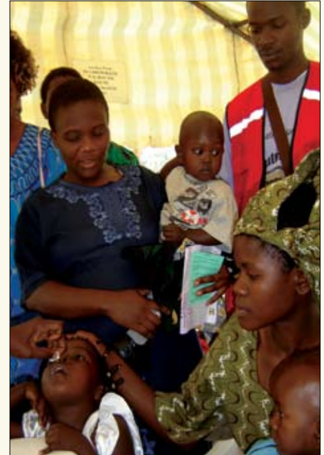
A Kenyan girl receives vitamin A drops during an integrated health campaign to help strengthen her resistance to disease.