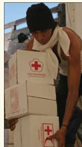
A Red Cross worker unloads relief supplies.

The remainder of this report describes some of the American Red Cross long-term programs underway or planned for the coming years to assist survivors and their communities. For additional information and updates on activities, please visit www.redcross.org/tsunami .