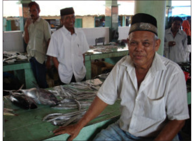
Indonesian men sell fish in a healthy market funded by the American Red Cross.

The massive scale of devastation which destroyed the livelihoods of 400,000 people in Sri Lanka, doubling the unemployment rate overnight, and thrust a further 600,000 people below the poverty line in Indonesia, created a critical need for investment and creative entrepreneurship. To meet this need the American Red Cross is partnering with organizations such as Christian Children's Fund/ChildFund Indonesia, CHF International, Mercy Corps, Save the Children, Triangle Génération Humanaire and the United Methodist Committee on Relief (UMCOR), to create livelihood opportunities which allow survivors to earn income and meet their economic needs — an essential element of sustainable recovery.