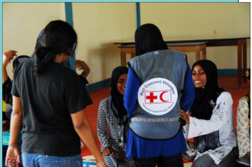
A new volunteer in the Maldives tries on her vest.

Community members have requested additional training so that more people can become Red Crescent volunteers.