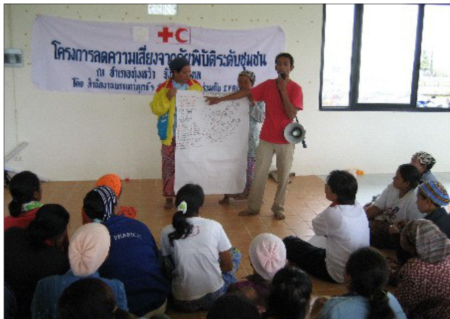
A Thai Red Cross staff member leads a community disaster assessment activity in Baan Rawai Nue, Thailand.

By equipping local Red Cross chapters and communities with radio networks, and teaching local rapid response teams to use and maintain them, the American Red Cross is supporting early warning systems in vulnerable communities. Last year, the American Red Cross worked in Indonesia, Sri Lanka and Thailand with local Red Cross members and communities to strengthen and expand early warning systems. The goal of these programs is to link these community-level systems into regional and national level systems that will ensure communities and local Red Cross members are able to communicate prior to, during and after the onset of a disaster.