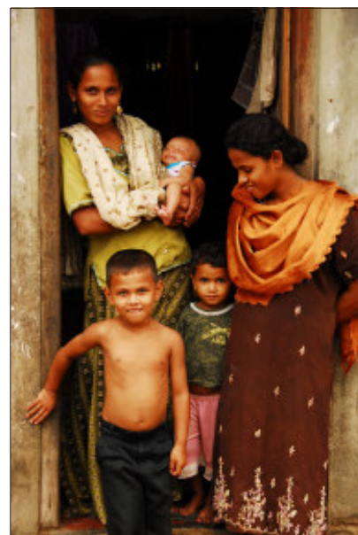
A Sri Lankan family oversees the reconstruction of their home through an American Red Cross owner-driven housing initiative in the town of Kinniya.

Funds are provided in stages, with each phase of construction evaluated by professional monitors to ensure that it is technically sound and meets local standards. Participants receive funds first to lay the foundation of their home. Once the foundation is in place and has been approved, participants receive the next stage of funding to