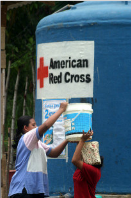
Two Indonesian women get clean water from a water storage tank provided by the American Red Cross.