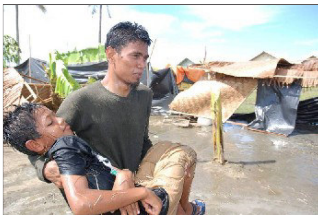
A community volunteer carries a boy during a disaster simulation activity.

Local Red Cross staff members have been trained in the Community-Based Disaster Risk Reduction program (CBDRR) which gives communities the knowledge, skills and equipment they need to reduce risk and mitigate the impact of future disasters. The American Red Cross works with local staff members, who train local leaders and volunteers to form rapid response teams, create disaster plans and conduct regular drills.