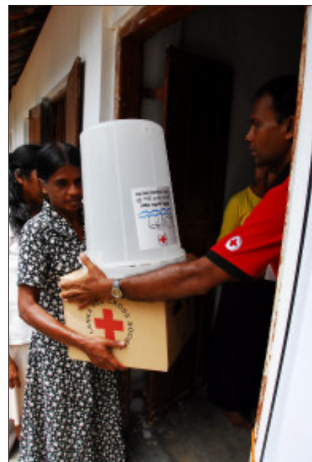
A Sri Lankan woman receives a ceramic water filter kit from a Red Cross worker.

In all American Red Cross water and sanitation programs, beneficiary participation is a crucial component. Involving community members in the planning, design and maintenance of programs helps ensure that the new sanitation facilities and drainage systems for schools and homes are appropriate and will be well maintained. Through holding regular meetings, trainings and follow-up visits, the American Red Cross is encouraging and empowering communities to commit to taking care of and maintaining their new water and sanitation systems.