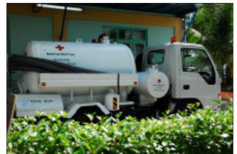
A septic truck provided by the American Red Cross benefits populations in the Maldives.

In Thailand's southern provinces, ten fishing communities now have fresh water during the rainy season, thanks to rainwater harvesting systems which allow them to harvest water during monsoons. These communities no longer have to carry water from nearby streams nor do they need to purchase water. The time and money these communities save by harvesting rainwater has allowed them to divert more time to income generating activities, invest in new capital and meet other pressing financial needs.