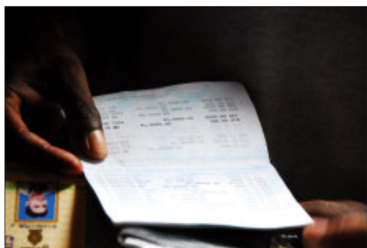
A Sri Lankan man holds a receipt showing he received a grant for the construction of the next phase of his house.