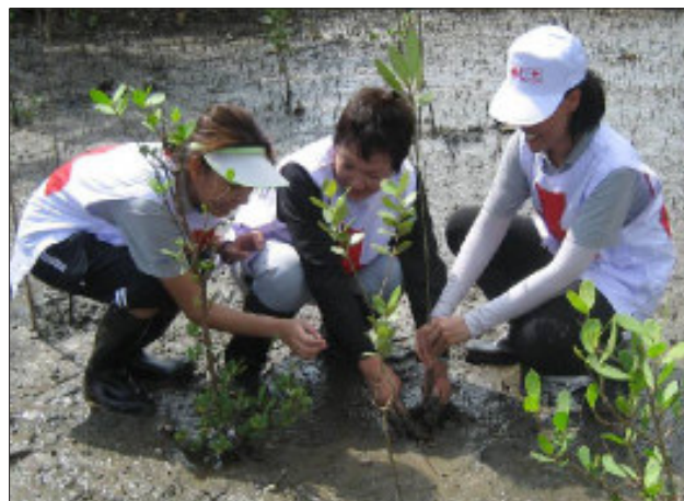
Mangrove planting, one of many disaster preparedness activities conducted in Thailand.