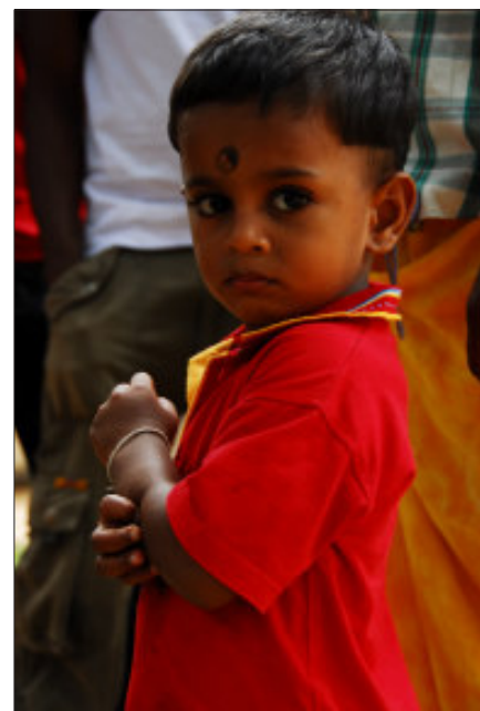
A Sri Lankan boy curiously watches a ceramic water filter presentation.

In the early stages of recovery, vaccinations were essential in preventing the spread of measles and polio. Cramped camps for internally displaced persons (IDPs), coupled with damaged water and sanitation systems, made conditions ideal for the spread of disease. Fortunately, an outbreak was averted, in part, through vaccination campaigns supported by the American Red Cross and its partners.