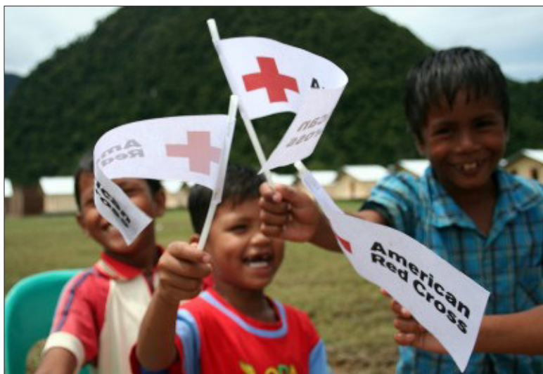
Indonesian children wave American Red Cross flags.

Despite these challenges, the American Red Cross strives to reach those in need, regardless of political affiliation, ethnicity, language or religion. The work of the American Red Cross upholds the seven principles—humanity, impartiality, neutrality, independence, voluntary service, unity and universality— that guide the work of the Red Cross and Red Crescent Movement.