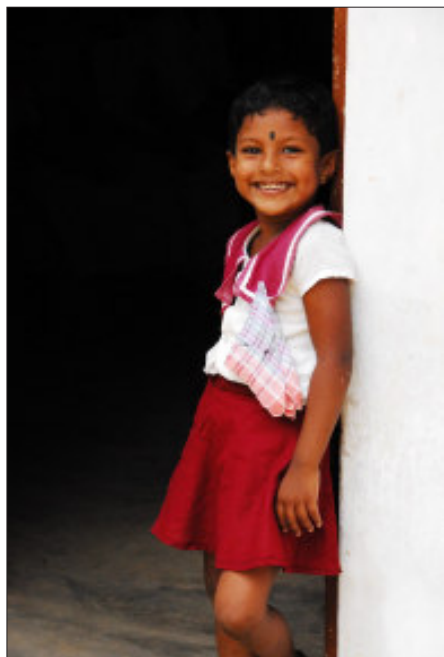
A Sri Lankan girl smiles as she watches a ceramic water filter presentation.