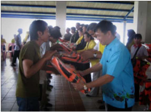
Red Cross volunteers give life vests to fishermen in Thailand.