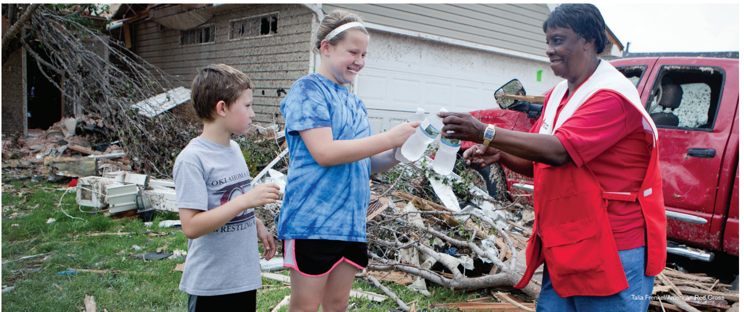
An American Red Cross volunteer delivers water to children in Moore, Okla.

Case managers already have identified 2,500 potential long-term cases and are working with those people to determine what they need and to offer assistance. In early November, the call center in Moore was receiving about 60 calls per day from people needing help.