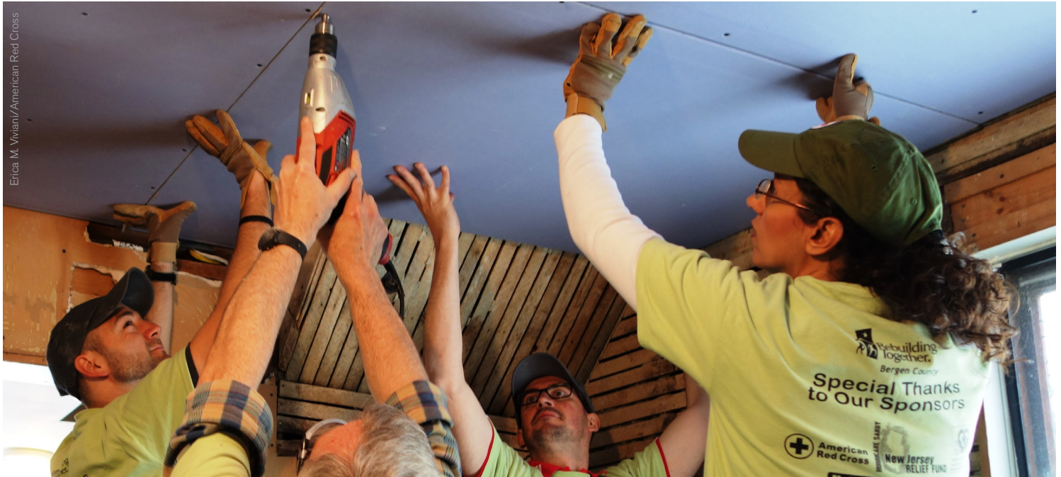
Red Crossers hang drywall at a Bergen County, N.J., home damaged by Superstorm Sandy, as part of Rebuilding Together's National Rebuilding Month.

A recovery effort of this scale is larger than any one organization, and the Red Cross has awarded grants totaling more than $91 million to dozens of nonprofits with specialized expertise and strong local ties. These grants have supported a network of skilled, community-based services that can best meet Sandy survivors' needs for food, housing, financial help, mental health support and guidance.