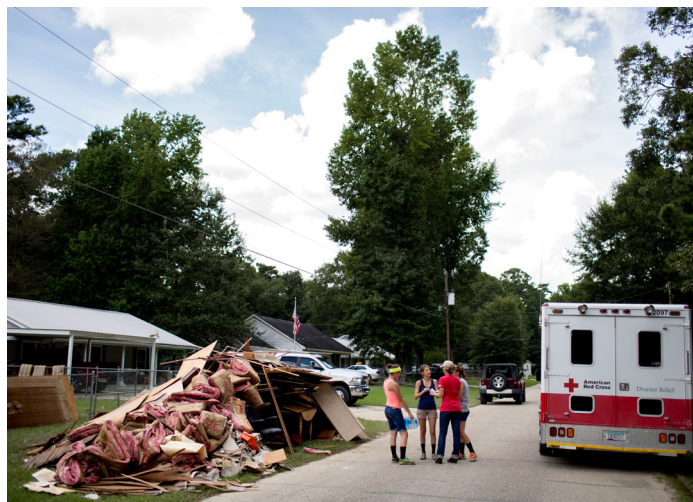
Across southern Louisiana, the Red Cross is helping thousands of people who are starting the long cleanup process.

Estimates show our relief effort could cost $25 million to $30 million. As of Sept. 13, we've received nearly $23