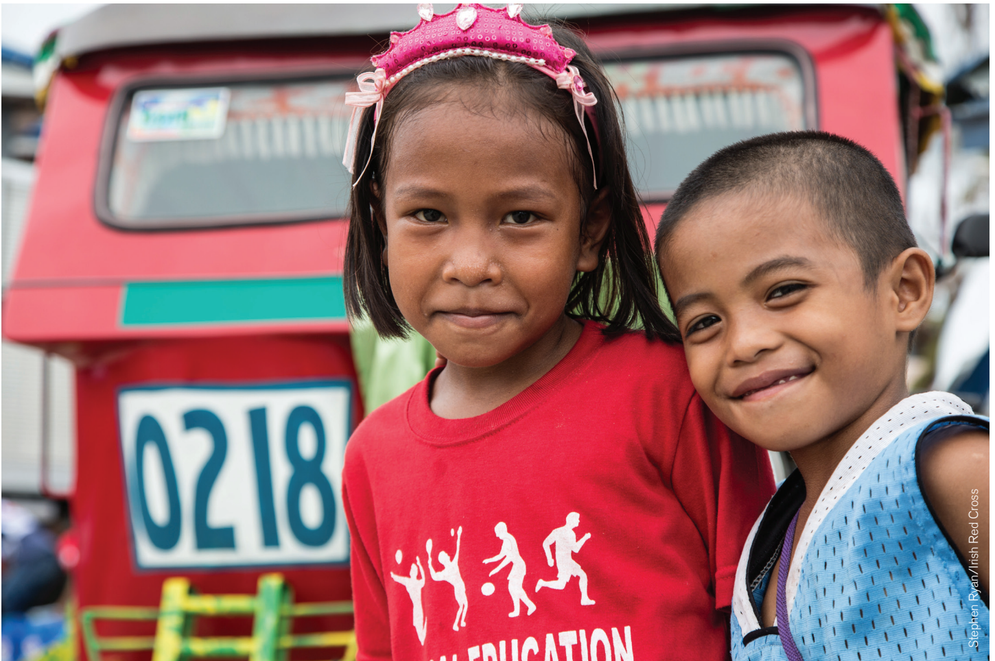
Children at a Philippine Red Cross relief distribution point in Tacloban City, Leyte.

The American Red Cross responds to disasters around the world by mobilizing financial support, providing pre-positioned relief supplies, deploying disaster response experts and, in some cases, implementing recovery and preparedness programs. The remarkable generosity of our supporters—individuals, corporations and foundations—drives our ability to provide relief and assist our partners in the global Red Cross network. We are grateful for your trust.