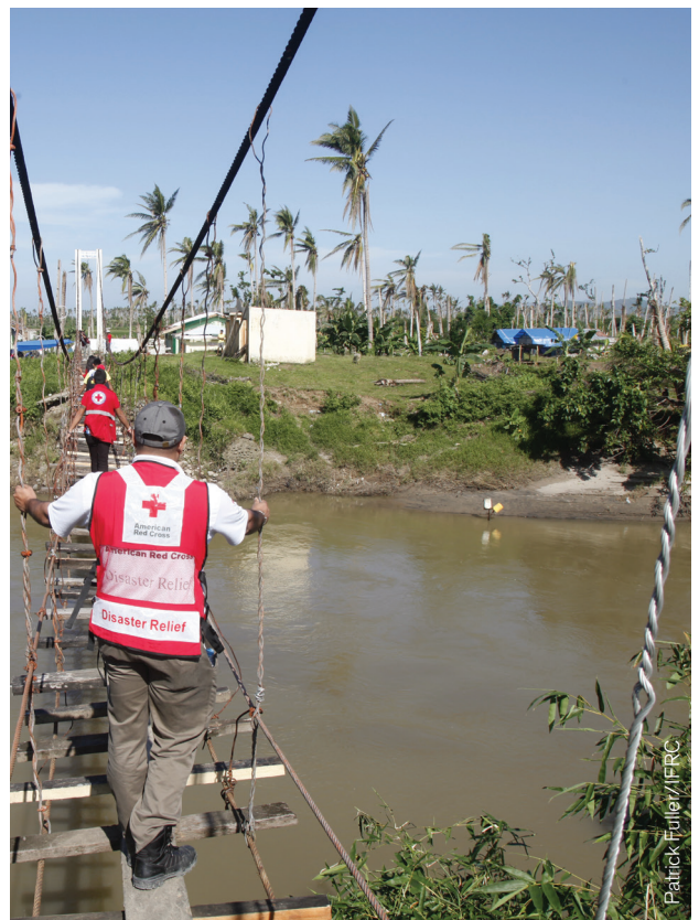
American Red Cross and Philippine Red Cross volunteers cross the typhoon-damaged footbridge to Balud, Tanuan, for an emergency cash distribution. The American Red Cross later provided construction materials for the residents of Balud to repair and shore up the bridge, making it safer for delivery of heavy relief supplies.