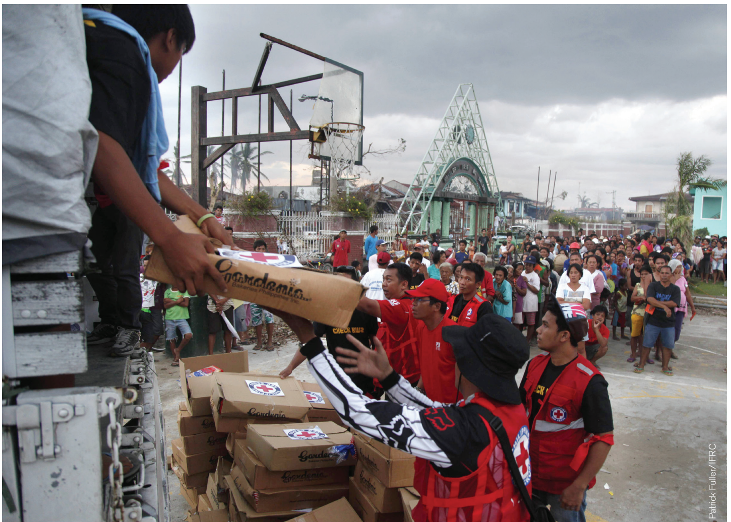
The Philippine Red Cross was one of the first organizations to distribute food relief to residents in the hard-hit town of Dagami, Leyte.

Teams from Red Cross and Red Crescent partners around the world rushed to the Philippines to help, and pitched in with a wide range of support, including crucial relief supplies, health care services, assistance with rehabilitation of clinics and hospitals, communications equipment, clean water and sanitation. The American Red Cross stepped forward with financial support, relief supplies, experienced disaster specialists and help with family tracing services that can reunite families with missing loved ones. Across the Philippines, local and international volunteers contributed from their diverse pools of expertise, united by the shared Red Cross mission to prevent and alleviate suffering.