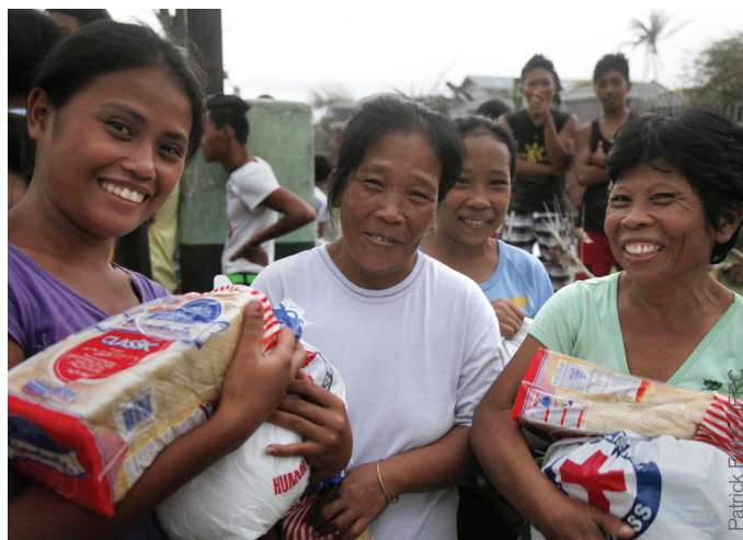
Thanks to our supporters, the Red Cross was able to provide critical food relief to typhoon survivors across the Philippines.

The American Red Cross responds to disasters around the world by mobilizing financial support, providing pre-positioned relief supplies, deploying disaster response experts and, in some cases, implementing recovery and preparedness programs. The remarkable generosity of our supporters—individuals, corporations and foundations—drives our ability to provide relief and assist our partners in the global Red Cross network. We are grateful for your trust.