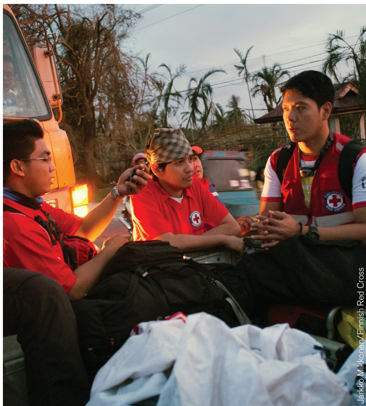
Red Cross volunteers deliver emergency water and food to a local hospital in the Philippines.