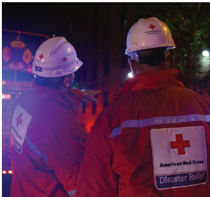
Red Cross disaster workers respond to thousands of home fires each year, like this May 2017 fire in New York City.

These large-scale disasters made up only a fraction of our disaster responses. Local Red Cross chapters were also at work in communities in every state across the country each day, responding to thousands of crises that, while not making national headlines, were lifechanging events for those impacted. With your help, the Red Cross brought relief and comfort to countless people affected by these and other everyday disasters in fiscal year 2017, including more than 55,000 home fires.