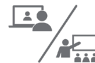
Online + Classroom